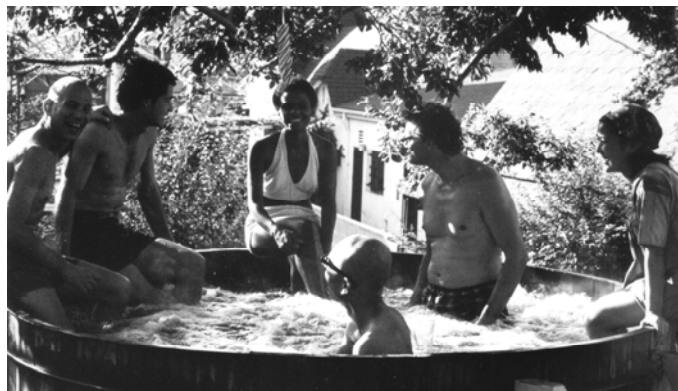
The good old days in the hot tub.