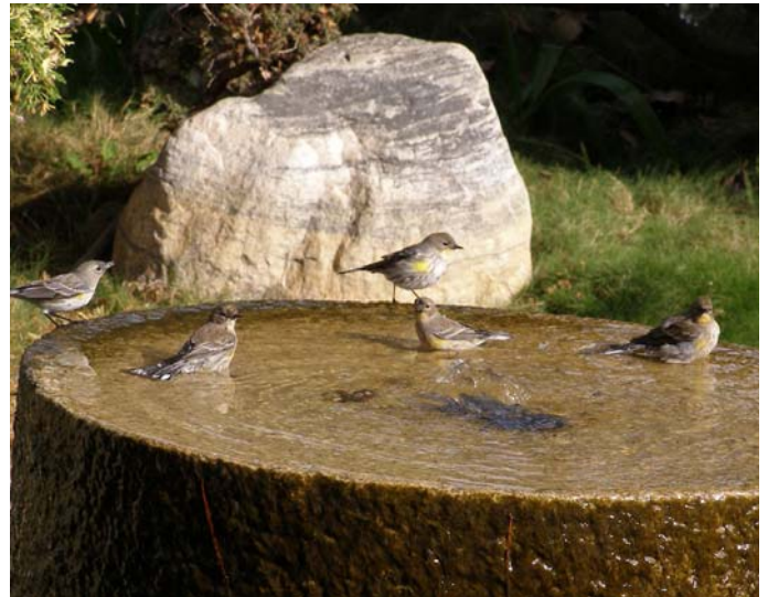
A boulder enjoying the Center's fountain hosting a sangha of birds, resting in the cool water.

We speak about "koan training," "koan study," "koan practice," and "koan introspection." The subtle distinctions here are that training with koans demands that you not only open to an intellectual understanding of the koan, but also embody— show with your body —the mani-