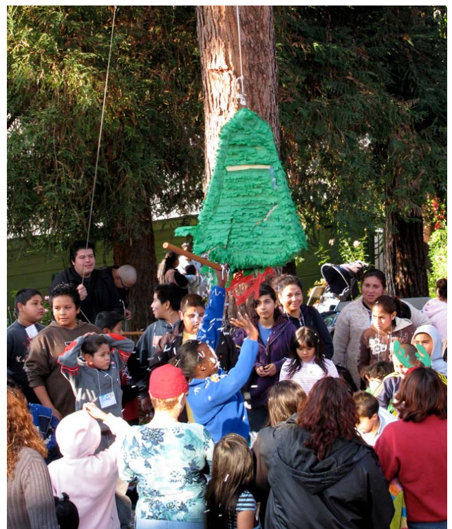
The lively celebration of breaking the piñata at ZCLA's annual Day of Dana, celebrating in community with Esperanza Center.